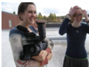
CHS Green Club